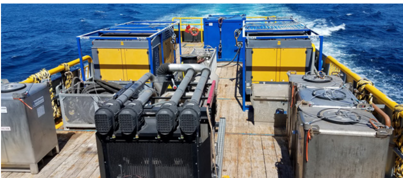
Air and N 2 Packages for Offshore