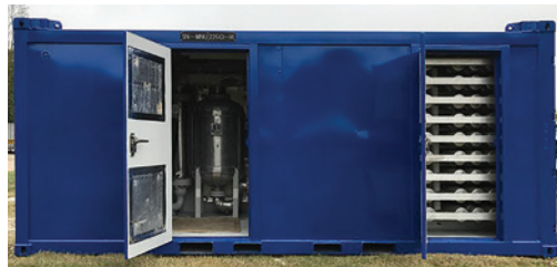
3500 SCFM Portable N 2 Unit