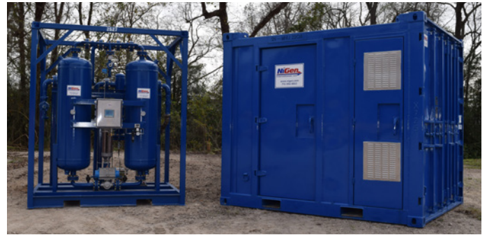
Air Dryer Package and Portable N 2 System. Rated for Offshore.