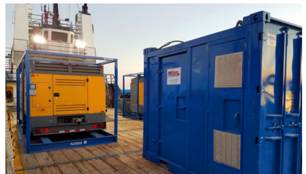
Air and N 2 Packages for Offshore