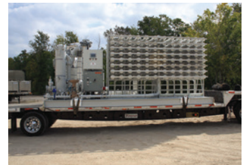
2500 SCFM Stationary N 2 Unit