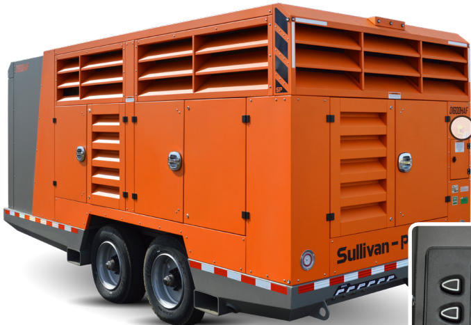
Sullivan-Palatek Electronic Controller (SPEC)